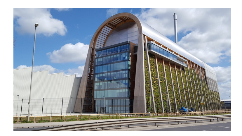
Caption: On 1st September 2016 the Environmental Sub Group visited the RERF Facility off Pontefract Lane

6. Ward Members, officers from the Communities Team, Housing Leeds, East North East Locality Team, Parks and Countryside and Waste Management Services were all in attendance. Items discussed included refuse collection, environmental enforcement action, grounds maintenance, parks and countryside issues as well as the Environmental Service Level Agreement (SLA).