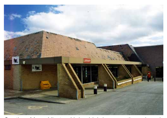
Caption: Moor Allerton Hub which is currently undergoing a revamp

19. The Alwoodley Family of Schools drama project, supported and funded by Ward Members, continues to provide exciting opportunities for local children to experience first-hand all aspects of the production process including filming & photography, storytelling & script writing as well as a back stage tour of the City Varieties Theatre.